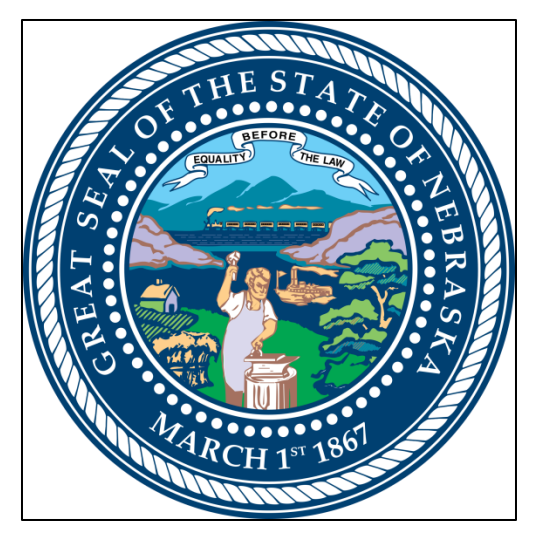
Seal Example: State of Nebraska