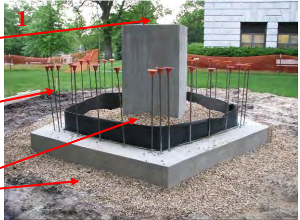
The foundation for the pentagon is ready for masonry.

River rock fill has been installed in the middle of the memorial and around the perimeter of the concrete frost walls.