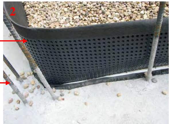
View of the new drainage mat for the foundation walls.

The steel rebar is embedded in the concrete.