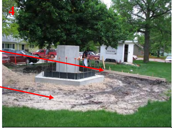
View of the memorial from the southeast.

The area that has had the sod removed will be the approximate size of the plaza on the memorial.